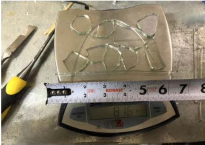
Photo No. 1 Impact Specimen No. 3 Failure

Example photo shown, a form of reference scale should be included with photo, e.g., ruler, tape measure, forensic ruler, etc.